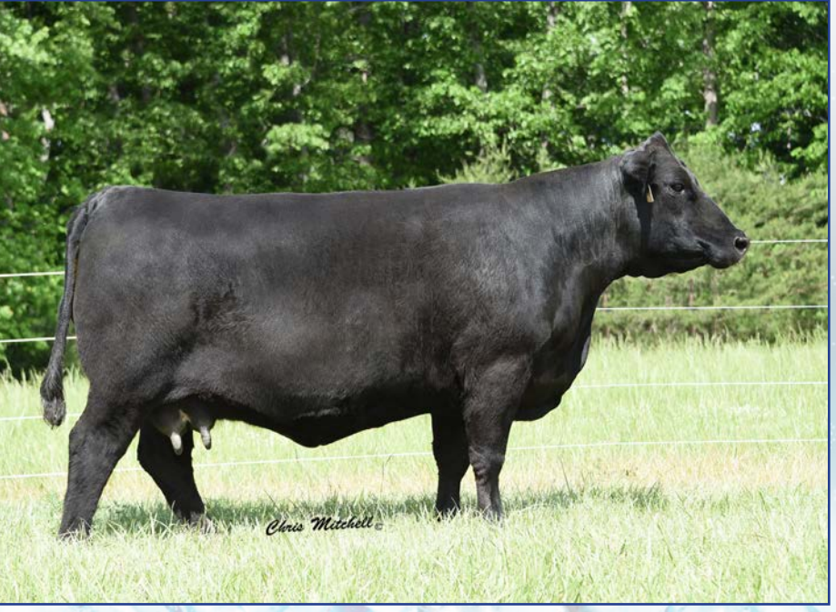
PRTY VER Ms Julia 1104X ET Donor Dam of lot 15 Embryos

Selling 4 conventional embryos with a guarantee of 2 pregnancies. Embryos must be placed by a certified embryologist for the guarantee. 1 embryo per pregnancy fulfills the guarantee.