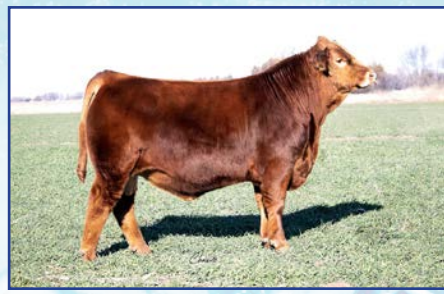
Ivers Red Bull H6