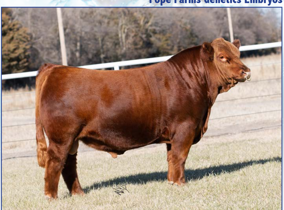
JLEA Tops Down