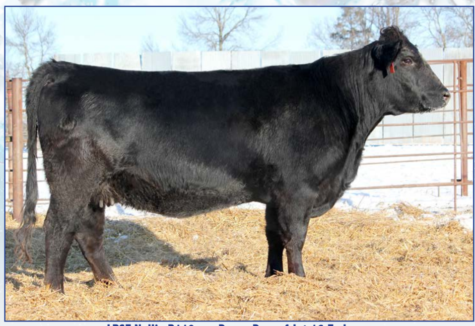
LRSF Nellie B119 Donor Dam of lot 16 Embryos