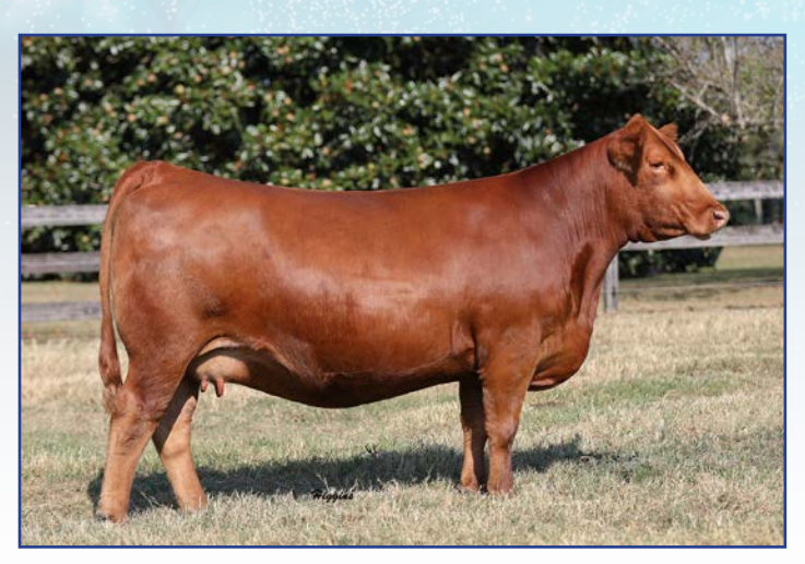
Maternal Sister to lots 5A & 5B

The first buyer also receives as a bonus 10 free straws of RWG Seminole wind semen!