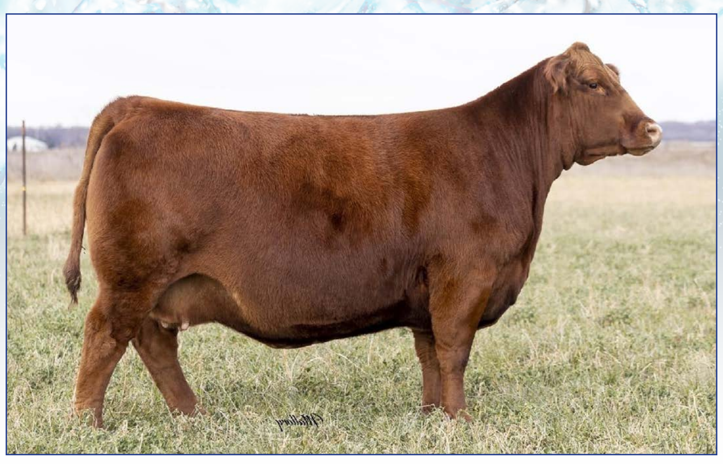
JRI Ms On Cue 214B5