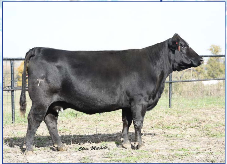
CCRO Carolina Cool 2330Z