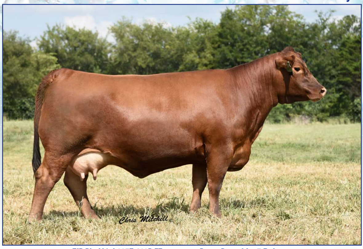
TJB Blackbird 827T 410B ET