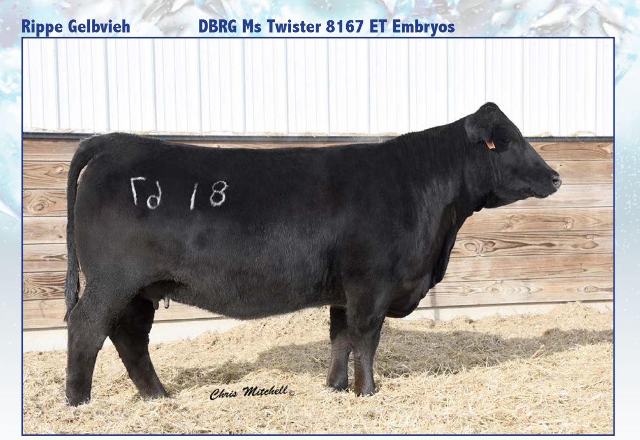
DBRG Ms Twister 8167F ET