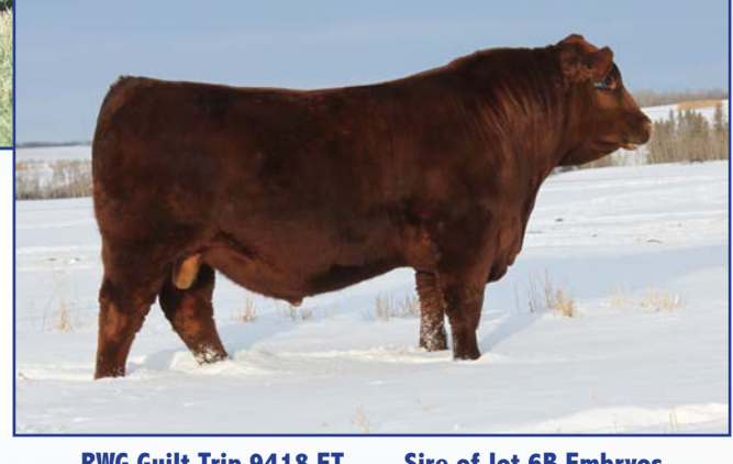
RWG Guilt Trip 9418 ET