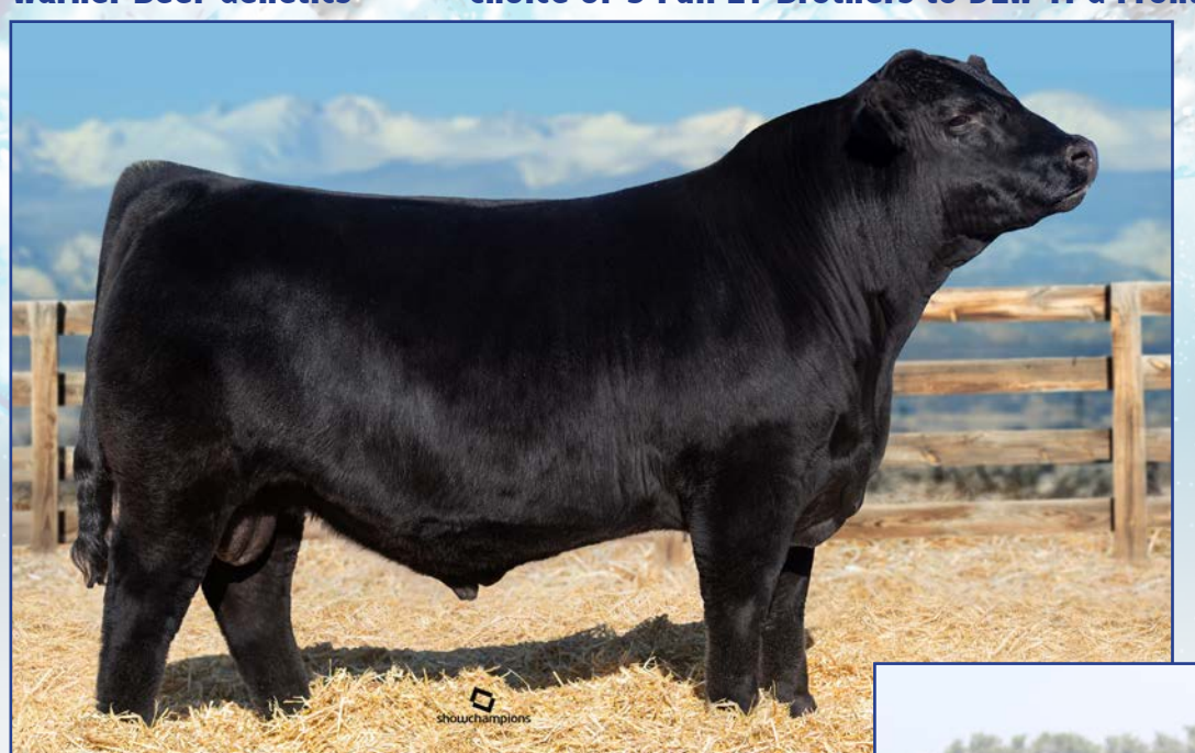
DLW TPG FRONTRUNNER 2510F