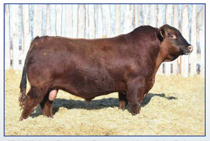
HDG Hillsdown Finnegan 4F