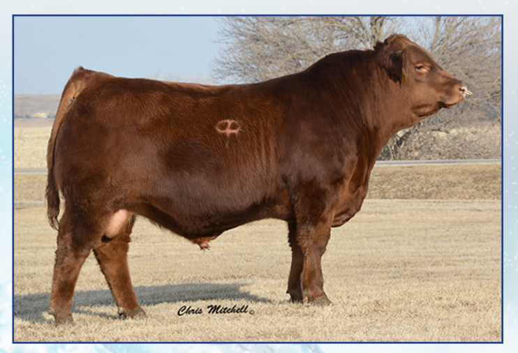
DCSF Post Rock Power Built 37B8 Semen sells as lot 12