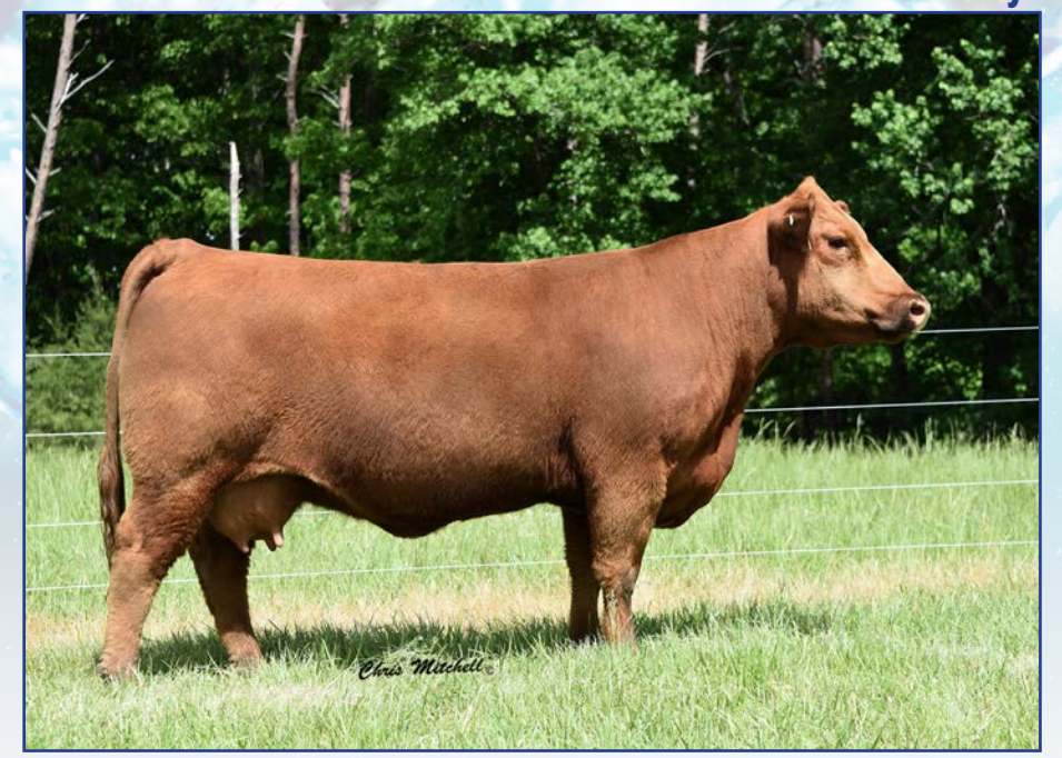
GCGF Niki 701E Flush Opportunity Sells as lot 14