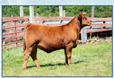
Ivers Rumchata G14