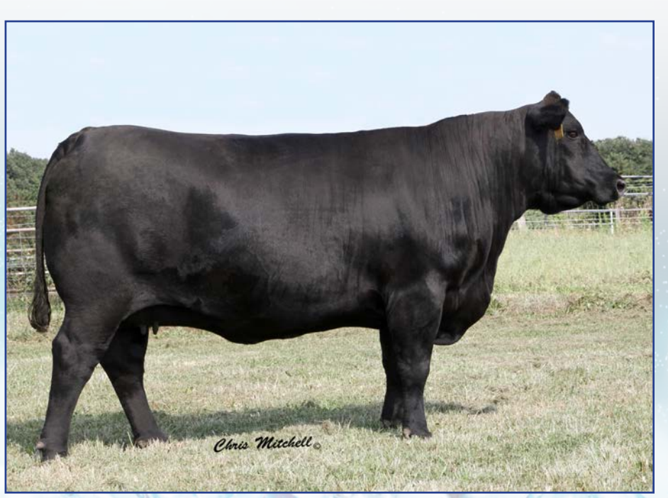
EHE Ms Twila's Focus W607 ET Donor Dam of lot 23 Embryos

Selling 6 conventional embryos with a guarantee of 3 pregnancies. Embryos must be placed by a certified embryologist. 1 embryo per pregnancy if needed fulfills the guarantee.