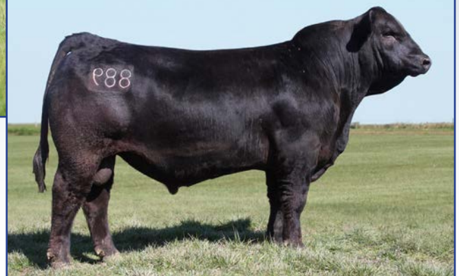
PADO Mr Jackpot 889FET Sire of lot 13A Embryos