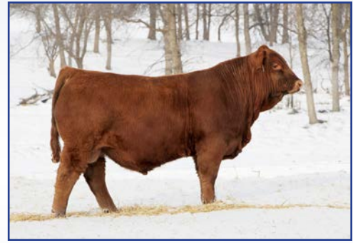
LRSF J188 Full Brother to lot 17 Embryos