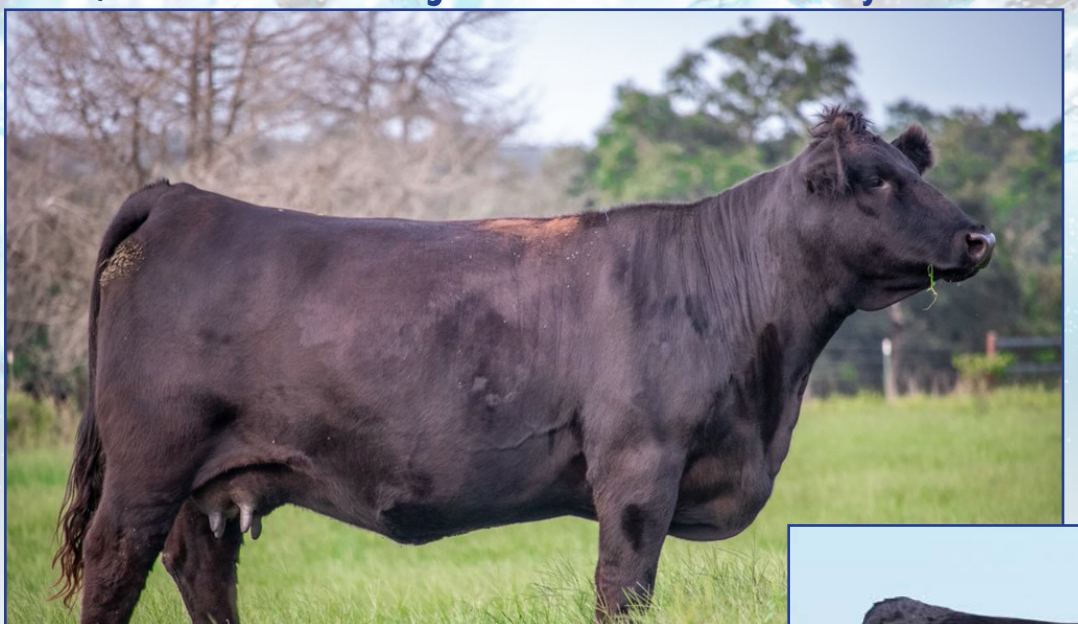
KARR Long Haul Princess E96A ET