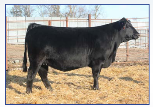
LRSF D40 Maternal Sister to lot 16 Embryos