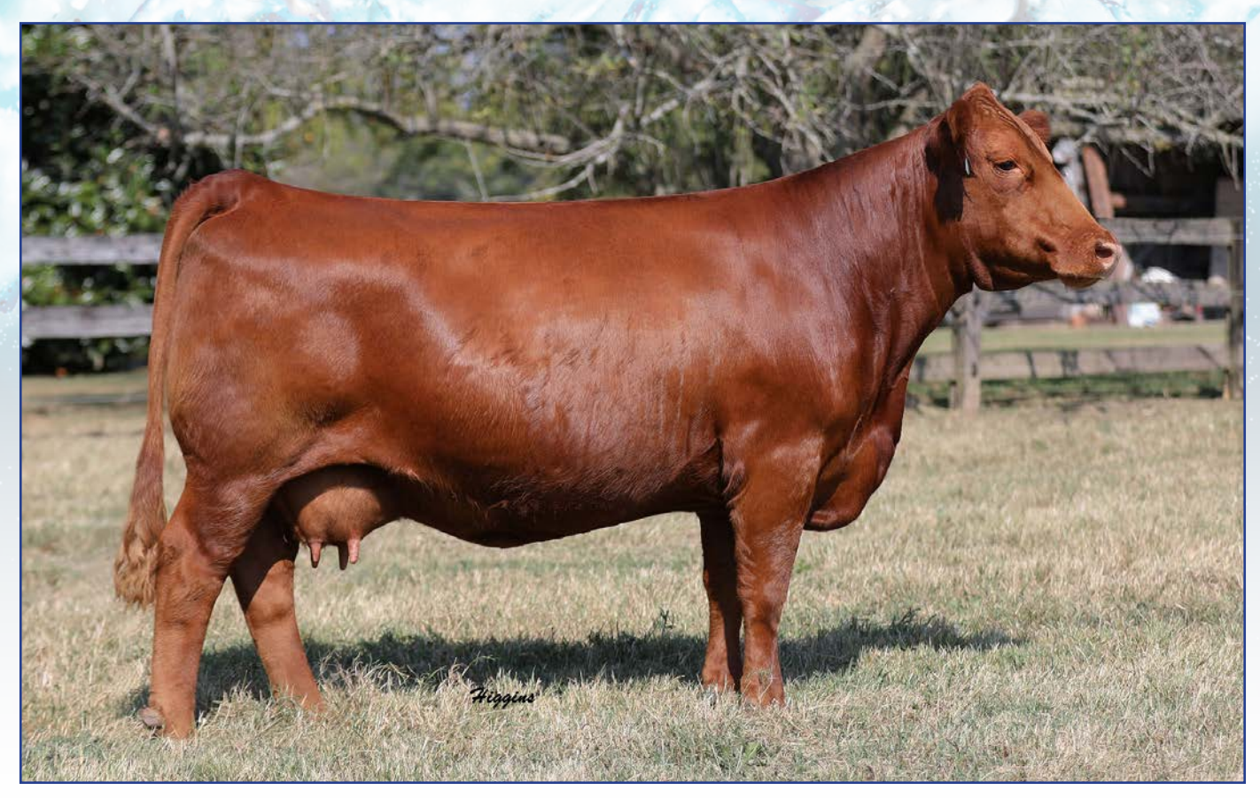
BCFG QVS Butlers Kali 282Z