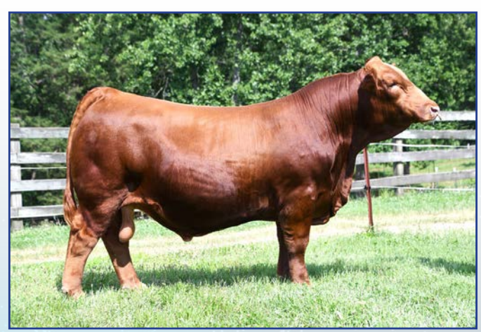
GHGF Man O' War F825