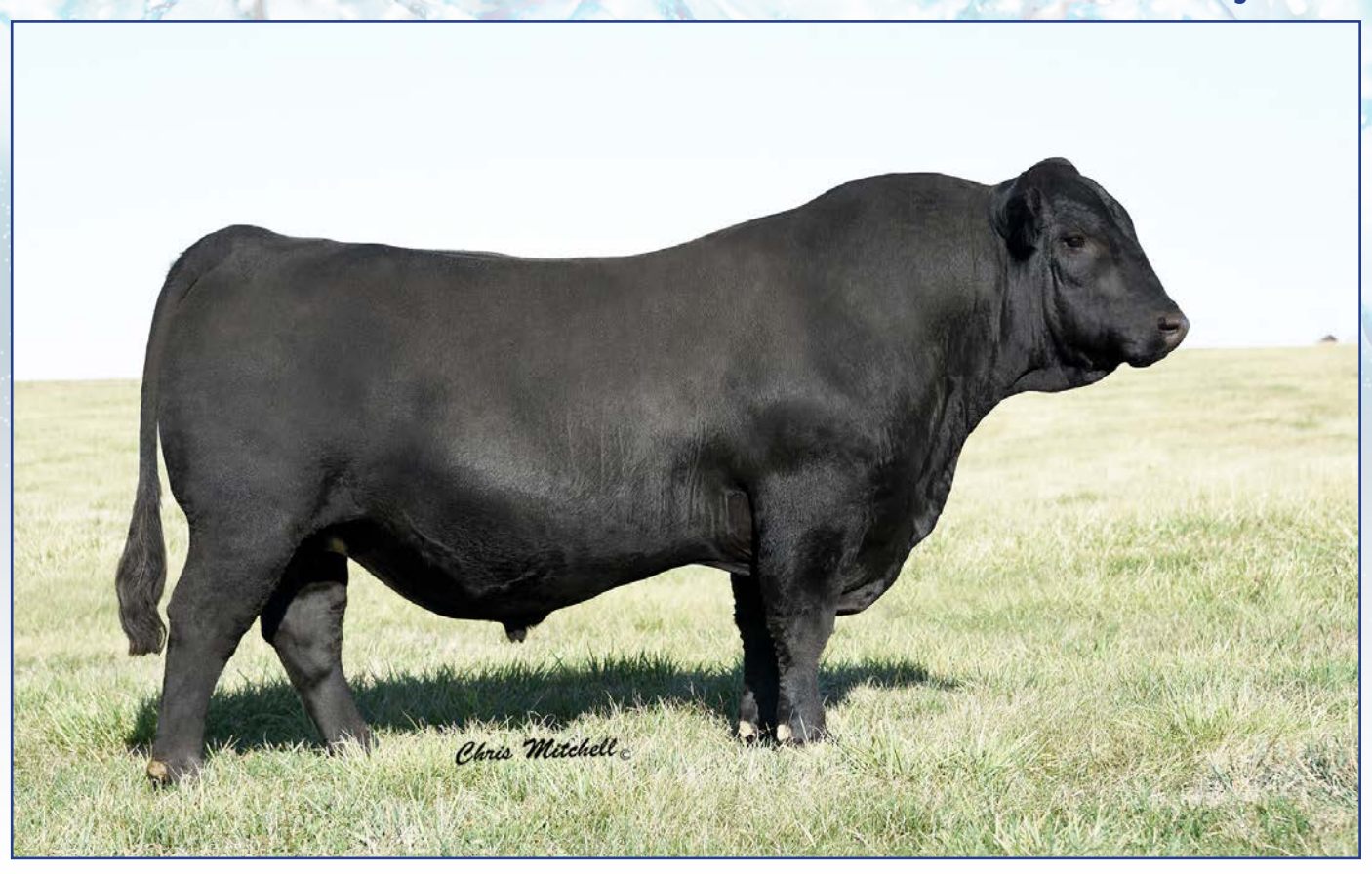
JKGF 417 Justice F819 Semen packages sell as lot 1