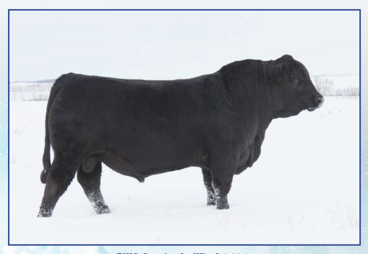
RWG Seminole Wind 9430 First purchase buyer receives 10 units of semen

Lot 5C was put in this sale simply because the proof is back in the barn! BCFG 207z1 x General Patton was a mating we were confident would produce high percent, stout, functional cattle! Just take a look at the full sib flush mates tied in the stall! These 2 boys were named champion and reserve champion purebreds at the North American. If purebreds like these two guys don't excite you, you must not like good cattle regardless of bred or color! For us here at Butler Creek we have always been the kind to sell our best and bring it town to display! We couldn't think of a better way to honor that commitment to raising quality seed stock than making these eggs available for the first time. BCFG 207z1 is owned by Butler Creek Farm and Distler family of Sunview Farms in Missouri. Selling 3 conventional embryos with a guarantee of 2 pregnancies per lot with a 4th and final embryo given to fulfill the guarantee.