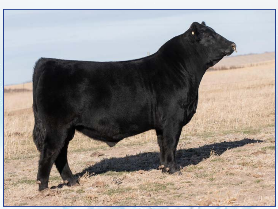
JLEA Therefore I Am