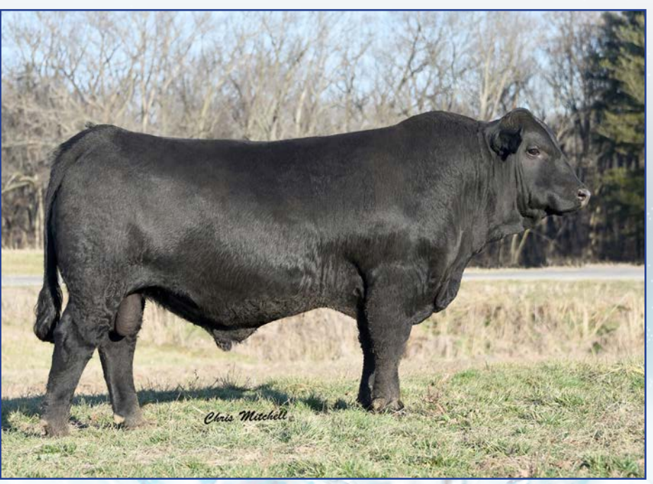
JKGF Horizon F825

Selling 6 conventional embryos with a guarantee of 3 pregnancies. Must be placed by a certified embryologist for the guarantee. 1 embryo replacement for each pregnancy not taken to fulfill the guarantee. All embryo shipping cost is buyers responsibility.