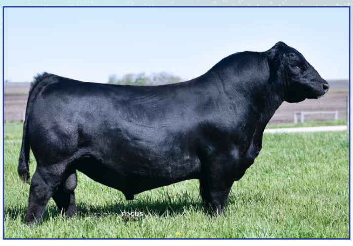
PVF Blacklist 7077 Sire of lot 5B Embryos