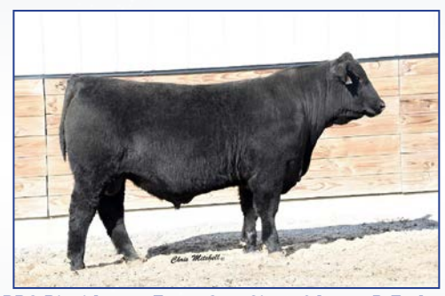
DBRG Riptide 710E 930G Sire of lot 13B Embryos