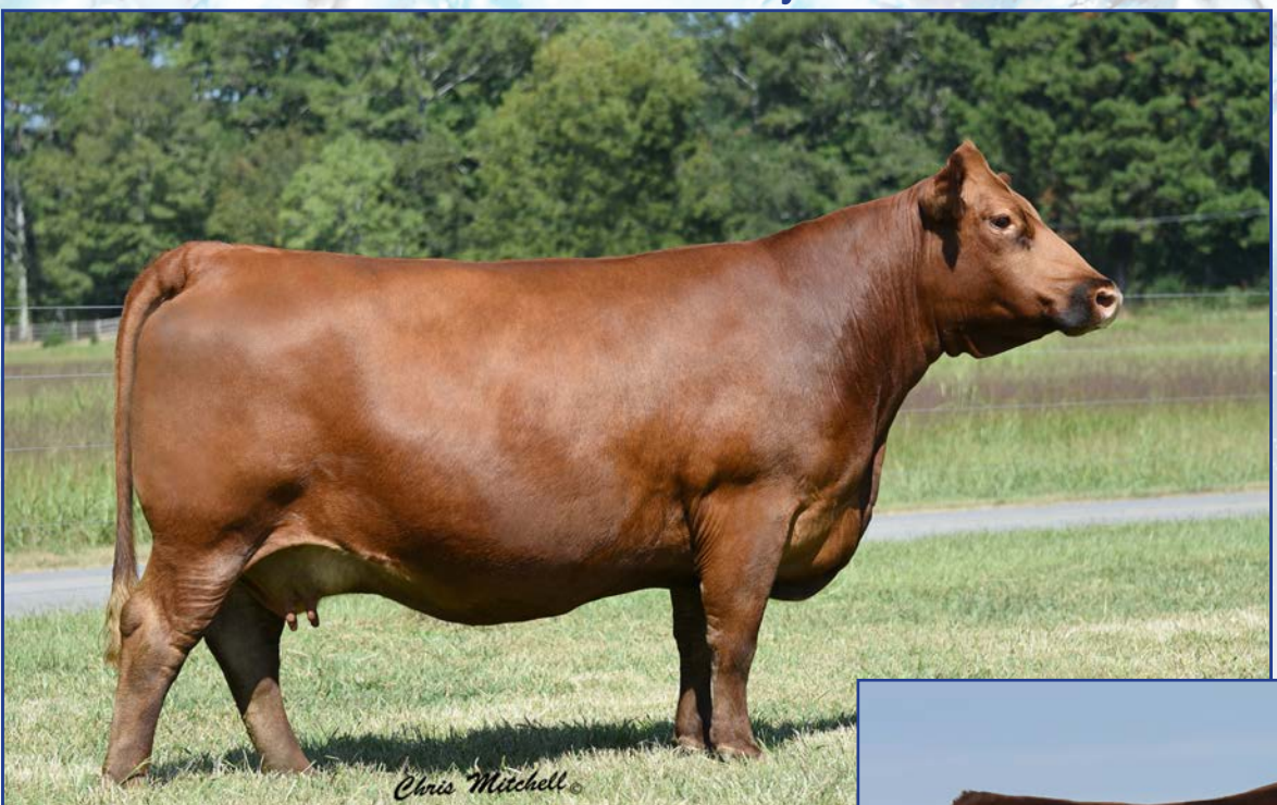
TJB Anissa 913U 149X