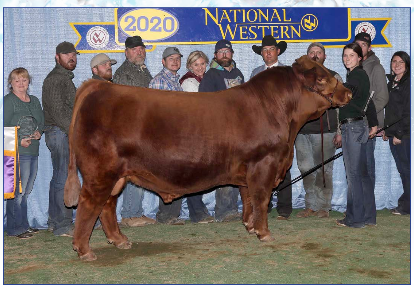
GHGF Man O' War F825