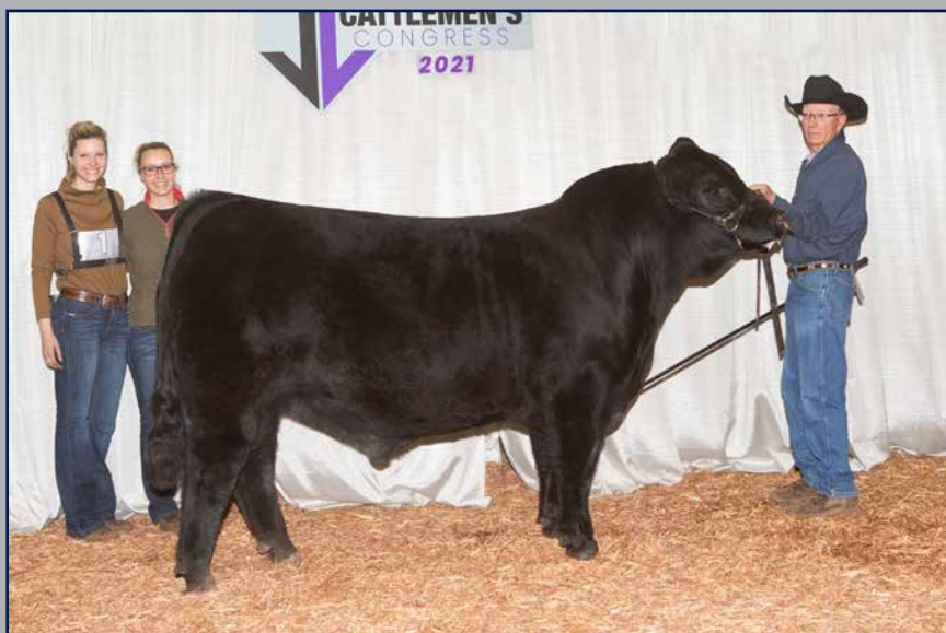
PHS Prohart Ol' Glory 935G

Sponsored by Breeder's Choice Gelbvieh Bull Futurity, Peoples Choice Balancer Bull Futurity, AGA Foundation and Gelbvieh on Ice