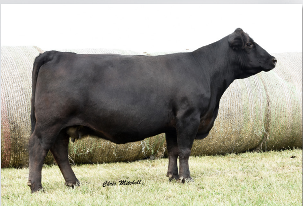
ABCS MS HAULER 004C

PE 5-2-21 to 9-1-21 to BNC D6268. Due Mid Feb.