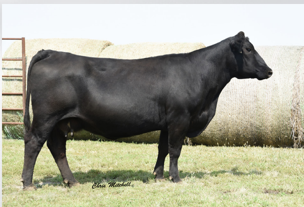
CPGG MS PRAIRIE 227E

PE 5-2-2021 to 9-1-2021 to BNC D6268. Due mid Feb