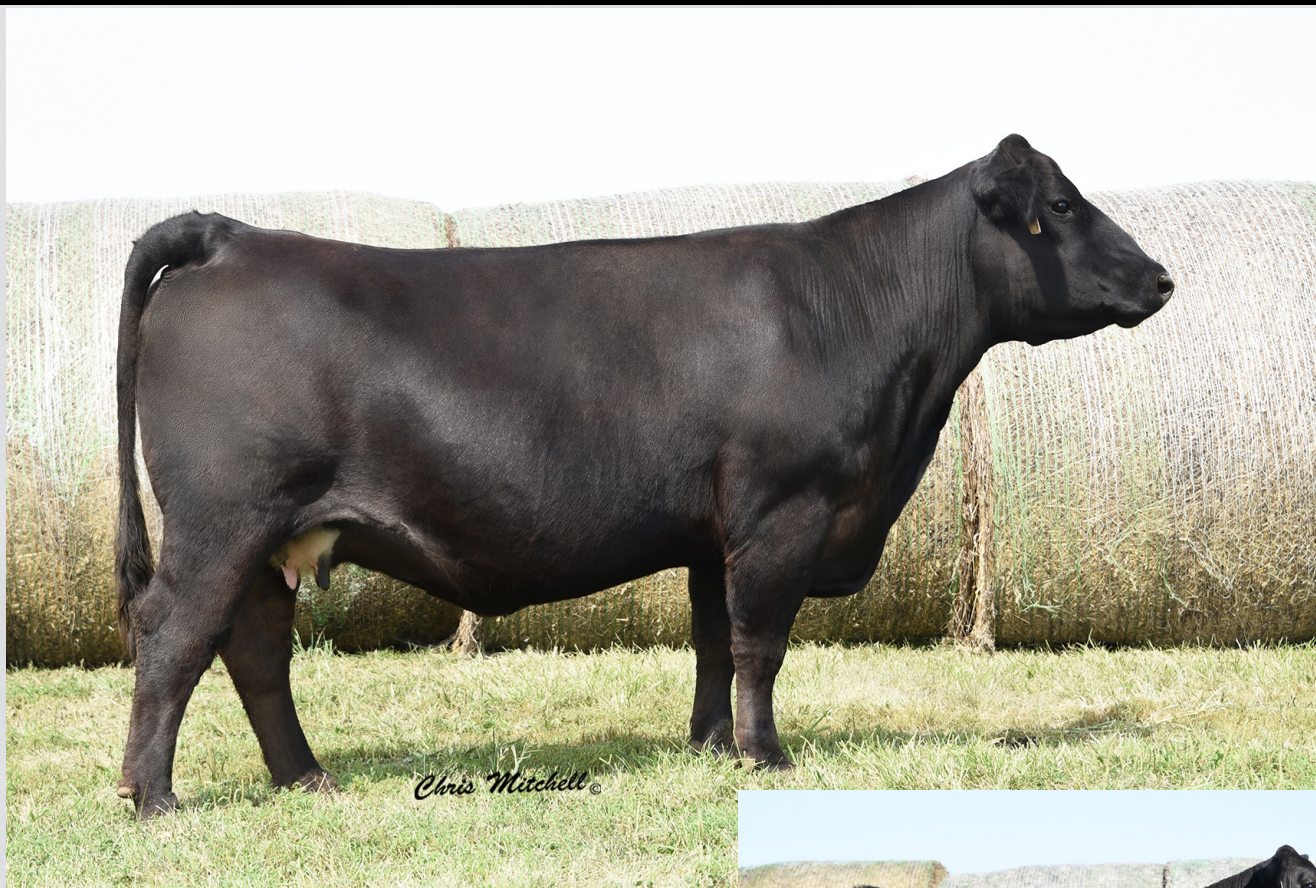
CPGG MS PRAIRIE ELSA Sells as Lot 5