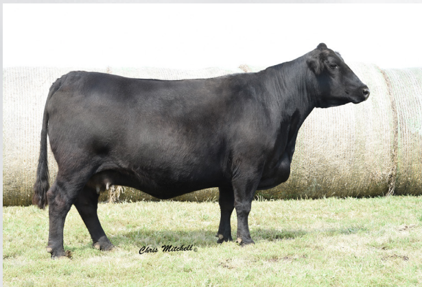
ELC MISS TELLE-ET

PE 05-02-2021 to 09-01-2021 BNC D6268. Due 3-20-2022