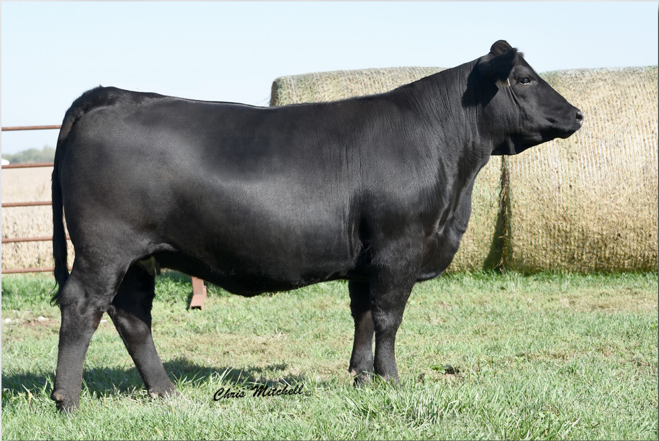
CPGG MS PRAIRIE HONEY 8H Sells as Lot 11