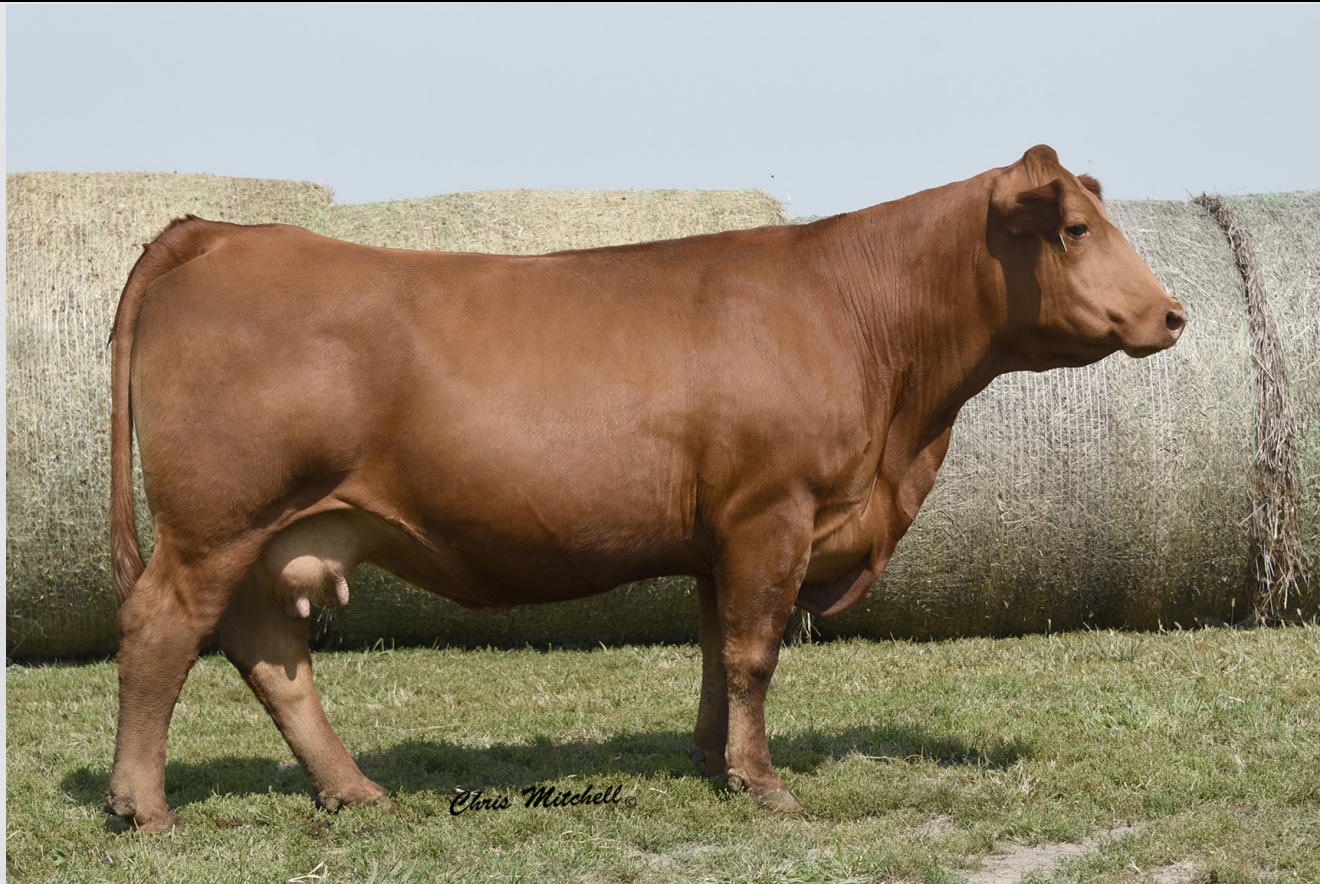
CPGG MISS PRAIRIE COTTON 417C Sells as Lot 4