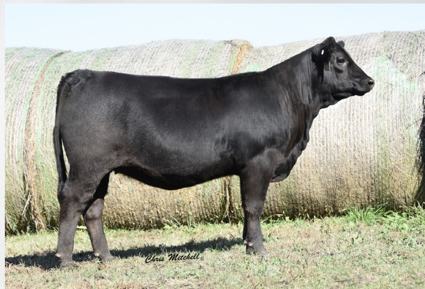
PGGC MS PRAIRIE JEZEBEL

Another of the very nice Black Mountain daughters to sell. Maternal sister sells as lot 38. PE 5-2-21 to 9-1-21 to BNC D6268. Due Mid to late Feb.