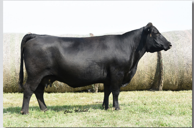
CPGG MS PRAIRIE 95B