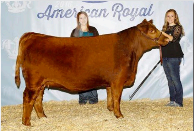
BNC MISS HOJER C524 SELLS AS LOT 1

Lot 1, AKA Big Red, was purchased from Hojer GV Ranch. Allan and Blake were gracious enough to sell her to us as a show heifer and future donor. She was Grand Champion Cow/Calf at the Big Red Classic in Grand Island and show successfully throughout her career. She has never been flushed, however her production record proves she should be in a donor program. She is a high volume cow with excellent maternal values. She ranks in the top 25% for both weaning and yearling performance and top 30% for marbling. Daughters sells as lots 1A and 2. be sure to look at these females as well. AI'd 04-27-2021 to PVF Insight. PE 05-02-2021 to 07-14-2021 to BNC D6268. Safe and due on 02-04-2022