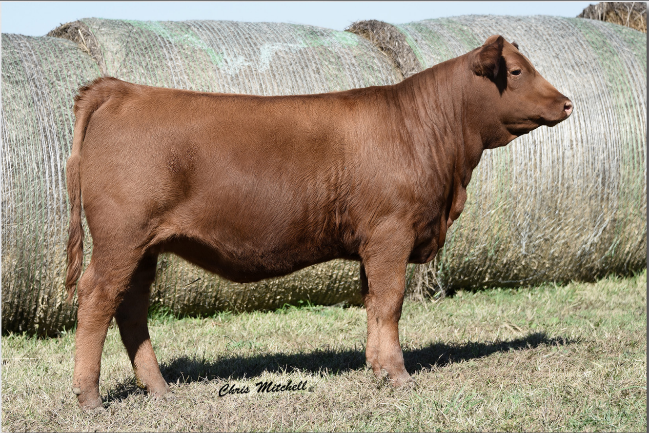
CPGG MS PRAIRIE J LO Sells as Lot 1A.