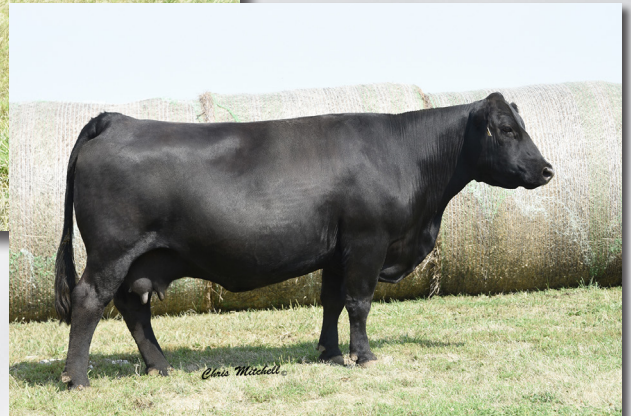
CPGG MS PRAIRIE ANGEL X211A