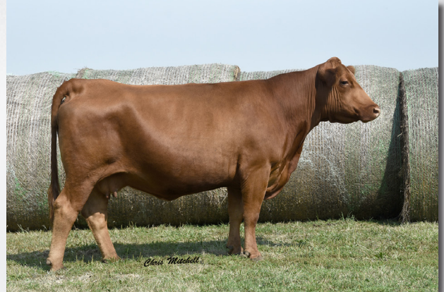
CPGG MISS PRAIRIE CHERRY 31C