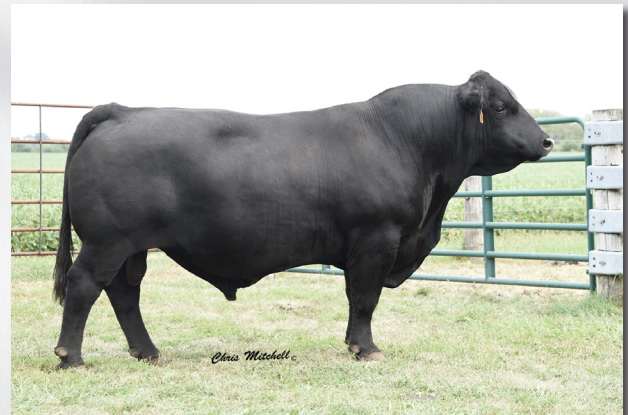
BNC MR HOJER D6268

J Lo is the 2021 daughter of "Big Red" that sells as lot 1. She is our top red heifer this year and a complete image of her dam. She is a high volume heifer with excellent eye appeal. Sells open