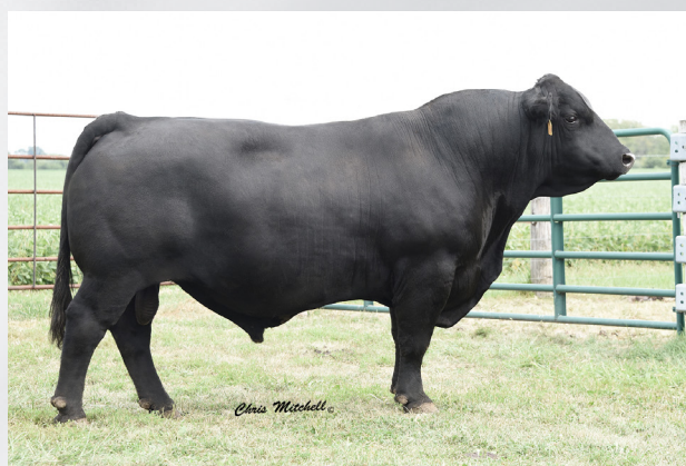
BNC MR HOJER D6268

Outstanding heifer calf with style and balance. Pictured above and her dam sells as lot 56. Sells open.