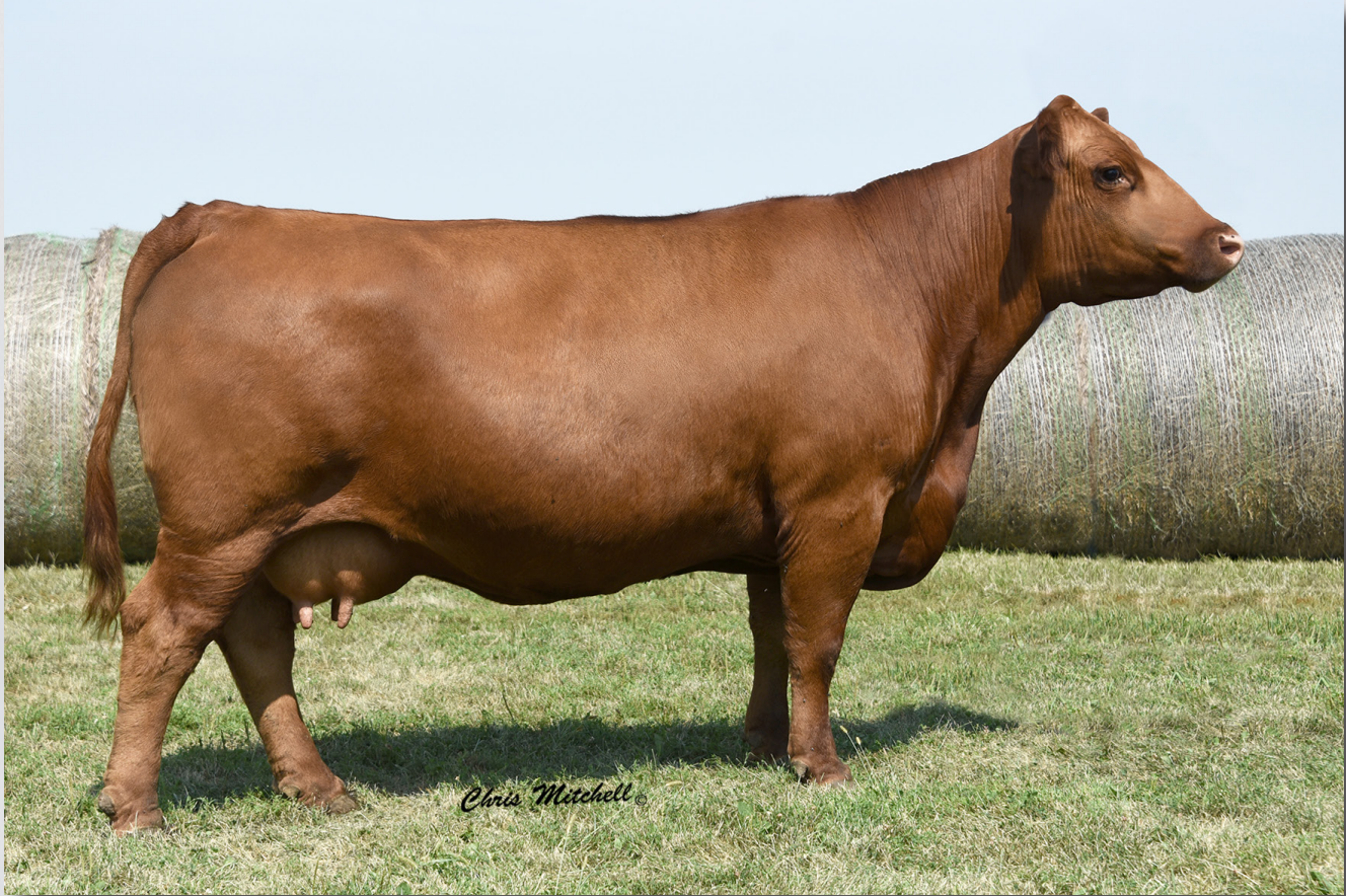
BNC MISS HOJER C524 Sells as Lot 1.