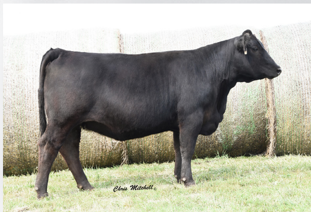
CPGG MS PRAIRIE HALEY 18H

AI'd 06-04-2021 to F806 Franchise. PE 06-09-2021 to 07-14-2021 to JKGF D020. AI safe due March 13, 2022.