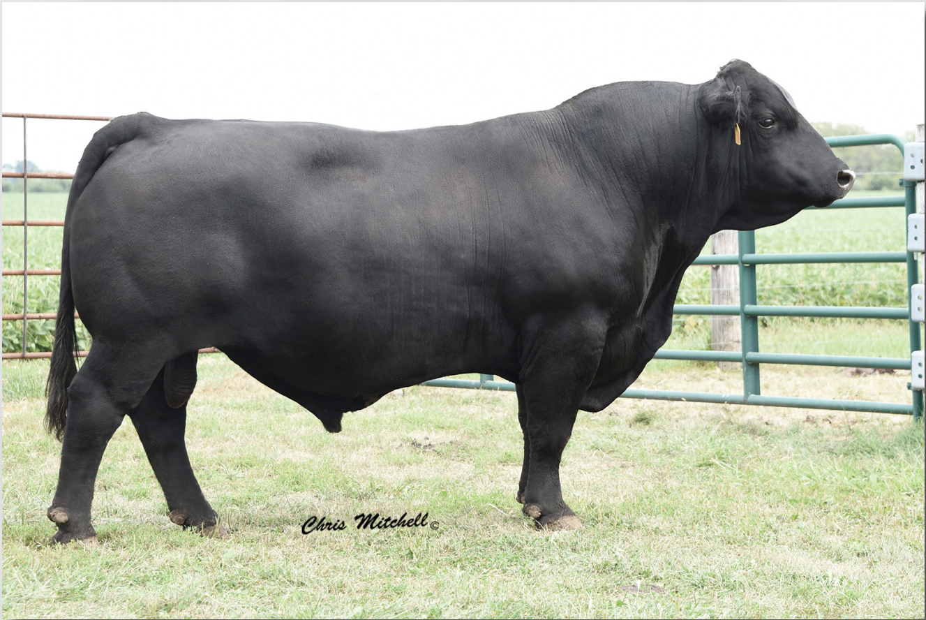
BNC MR HOJER D6268