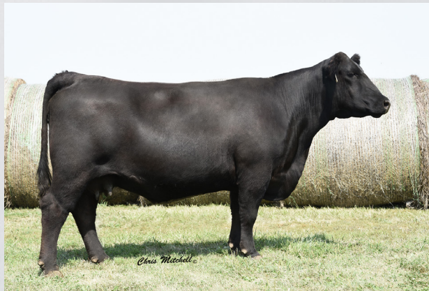
CIBS PARIS 7330E