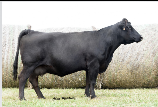
PGGC MS PRAIRIE ZURI

PE 5-2-21 to 9-1-21 to BNC D6268. Due Late Feb.