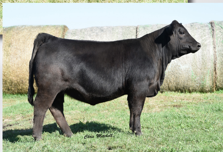
CPGG MS PRAIRIE JASMINE

Pictured above here is the deepest-stoutest heifer calf in the offering. A young heifer with great potential for production of high volume attractive cattle. This cow family has done amazing things for us over the years. Sells open.