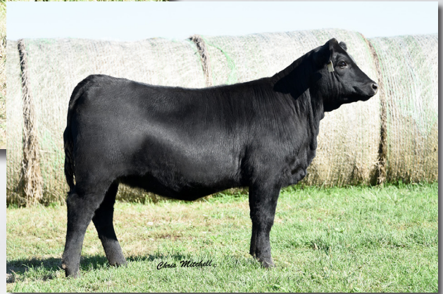
CP GG MS PRAIRIE ANGEL X211A