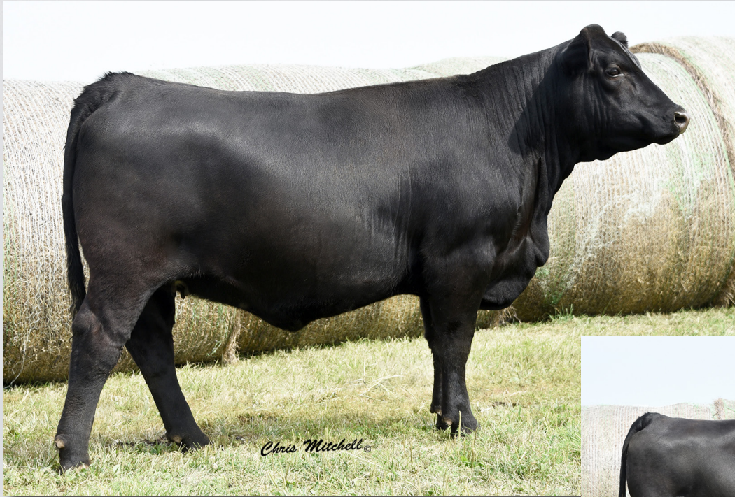
CPGG MS PRAIRIE HOPE 9H