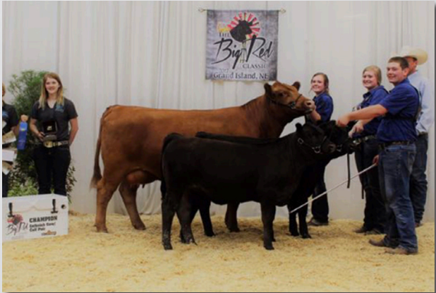
BNC MISS HOJER C524 SELLS AS LOT 1