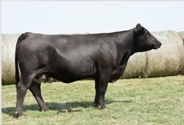
LJMC DELLA 5008C