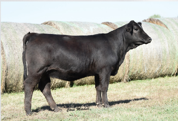
CPGG MS PRAIRIE JEEPERS 33J