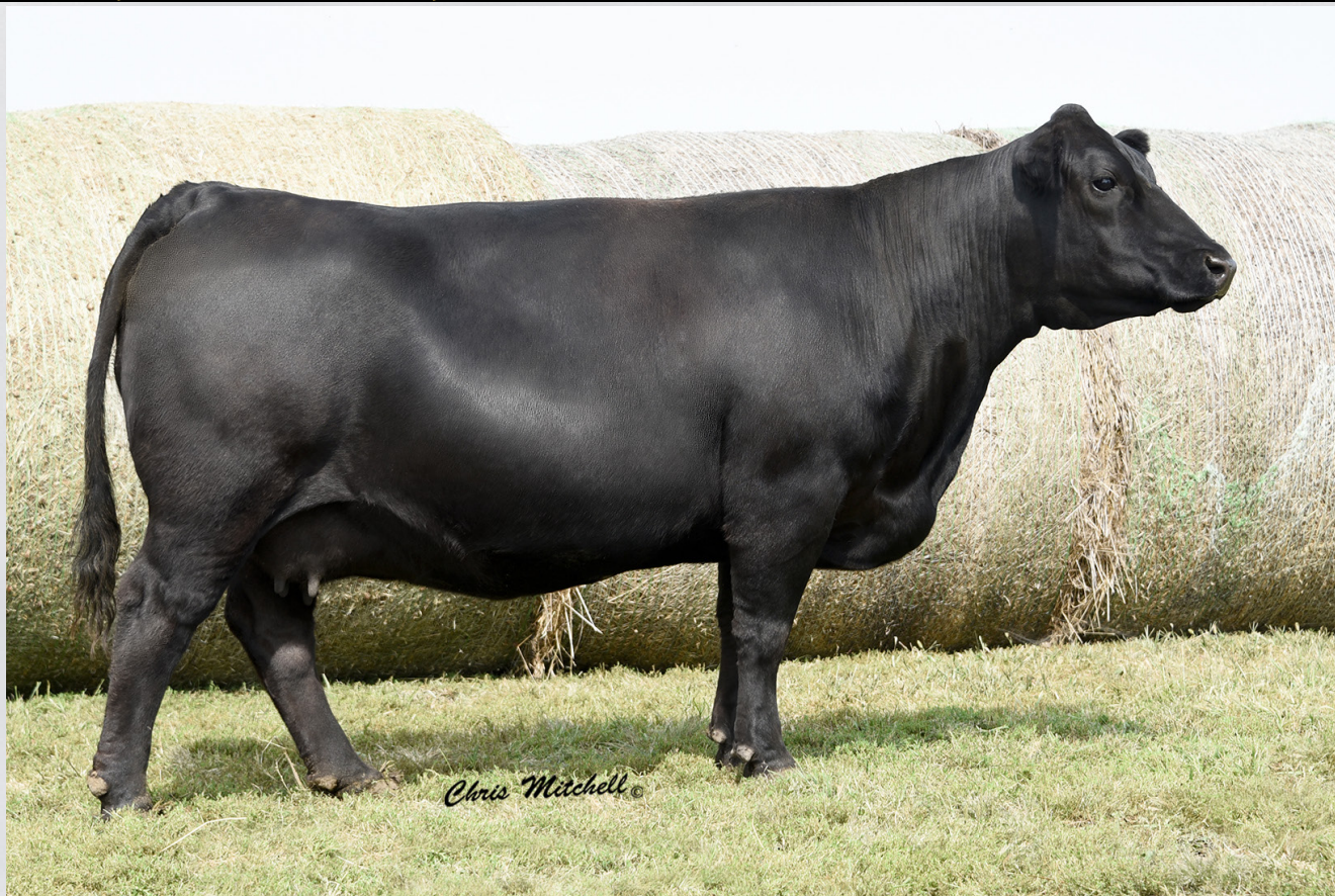
HRNK MS CYCLONE 7B 604D Sells as Lot 23