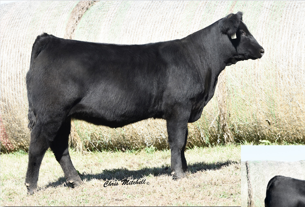
CP GG MS PRAIRIE JOLLY 69J