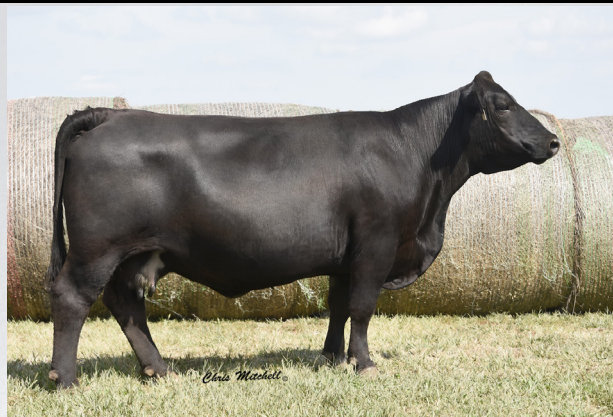
CPGG MS PRAIRIE BLOSSOM 916B

AI'd 5-9-21 to F806 FRANCHISE and PE 5-27-21 to 6-22-21 to PGCC 17H. Safe AI due 2-13-22