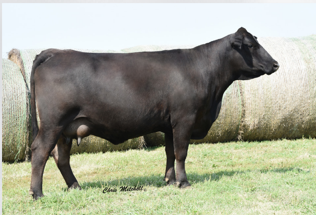
CPGG MS PRAIRIE 45G