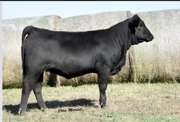
CPGG MS PRAIRIE 3J

PE 5-2-2021 to 9-1-2021 to BNC D6268. Due Early Feb.