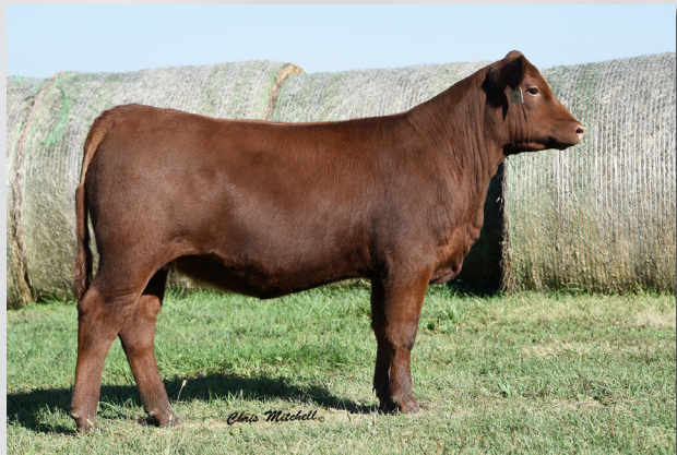
CPGG MS PRAIRIE JANE