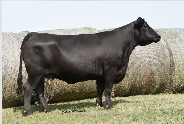
CPGG MS PRAIRIE BEE 21B