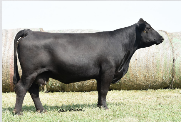
CPGG MS PRAIRIE BELOVED 922B