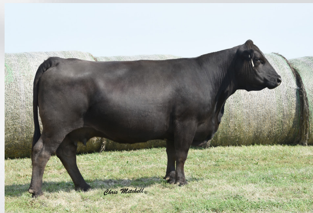
CPGG MS PRAIRIE 316Z

AI'd 5-7-21 to Deer Valley Growth Fund. PE 5-27-21 to 6-22-21 to BNC D6268. Safe AI due 2-13-22.