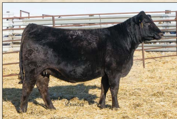
DDGR 72C • Sells as Lot 35.

Exceptional volume and depth of rib on this purebred daughter of the Alumni sire. Her dam is also an attractive female with ample capacity and is a daughter of the Patriots Minuteman sire that was known for his high quality daughters. She is due on March 20 with a purebred bull calf by our new black calving ease sire, CKS Dream C11.