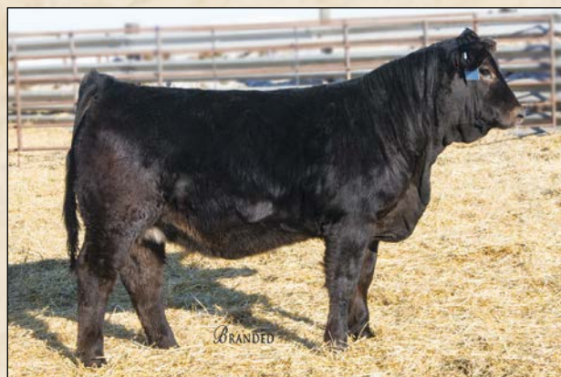
SGAR Miss Dally 602D • Sells as Lot 55.

Dally is the first calf we have raised out of the awesome PHG Z21 cow. She has a moderate birthweight and really grew displaying profitable growth potential. She has loads of body and at the same time she is clean fronted and stylish. This gives her the moderate size and overall appearance that producers are looking for. Sells open.