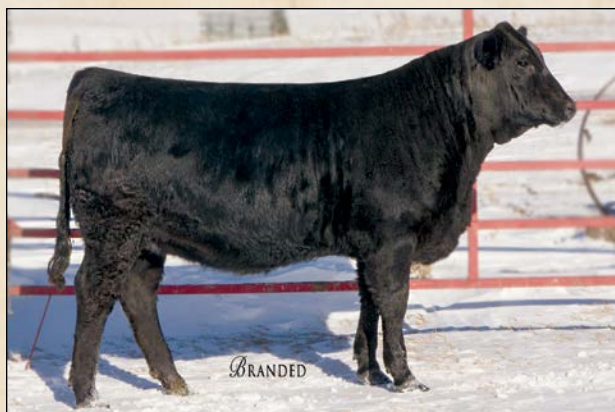
BDOC Deja 333D • Sells as Lot 52.