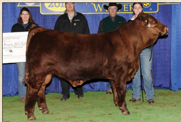
PHG Rockin the Bakken Z17 • Sire of Lots 3, 4.

Performance bull sired by a past Breeder's Choice Gelbvieh Bull Futurity Champion, PHG Rockin The Bakken. His dam is a true calving ease female that post a -4.5 birth weight EPD. 1D weaned with a weaning ratio of 109.