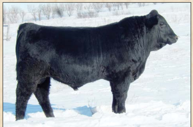
WOHL Leverage's Pepper D23 • Sells as Lot 13.

Powerhouse bull from a moderate built female. He is packed with muscle and has a cow family that demonstrates producing replacement females and high weaning weights. Three bulls in this year's sale going back to dam N22. Sire verified and docile. Retaining 1/3 semen interest.