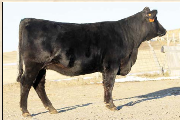
JMAU Cindy Lou • Sells as Lot 26.

A moderate framed daughter of VRT Lazy TV Sam U451 and a CTR Good Night 715T dam that continues to produce one of our top calves every year. Strong maternal strength with a nice combination of muscle and femininity. Al'd 5-10-16 to Buck's Carolina Rockn (794476). PE 5-14-16 to 7-27-16 to YJMR Up Start B54 (1316500)