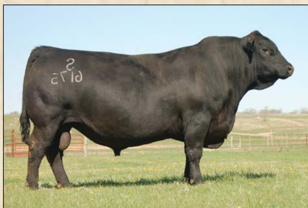
S Chisum 6175 • Sire of Lot 33.