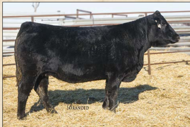
DDGR 9C • Sells as Lot 28.

This female has a great future with a very strong EPD profile and excellent carcass ultrasound data to go with it (112 ratio on ribeye and 113 ratio on IMF). Also, as a 75% Balancer you can breed her up for purebreds or down for Balancer calves. Her sire, the Post Rock Ten Plus bull, has left some real strong females in our herd. She is due on March 7 with an AI bull calf by the DLW Alumni sire.