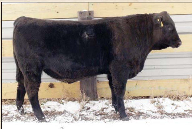
FGC D6 • Sells as Lot 22.