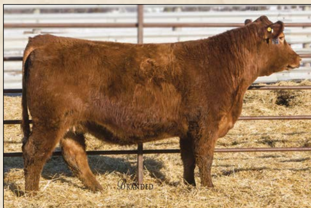
DDGR 93C • Sells as Lot 38.