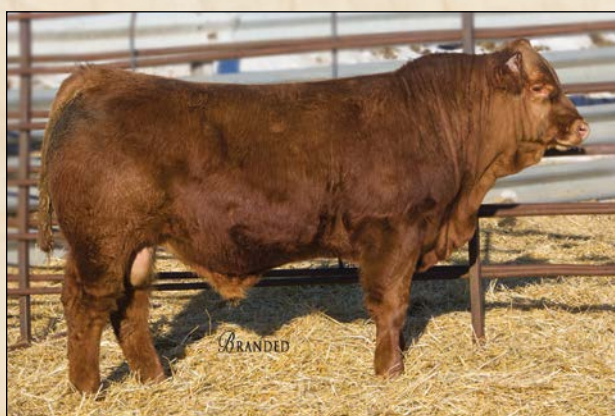
CMK D11 • Sells as Lot 9.

Long bodied, deep, and thick son out of RB Tour Of Duty 177 an industry leader for growth and maternal. Combined with his Wohl Otto X7 DAM, wow can't wait to see his calves! Weaning weight of 816.