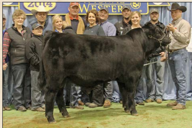
DLW Alumni 7513A • Sire of Lot 34.