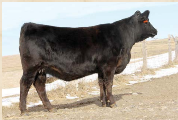
CJLL Cammie • Sells as Lot 32.