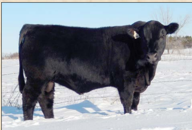
WOHL Ludlow North D31 • Sells as Lot 17.

WOHL FARMS, JOHN WOHL Genomic enhanced EPDs. Heifer bull and sire verified. Consistent low birth weight and calving ease on sire and dam sides. His stylish sire was selected to use for calving ease on heifers and add carcass value. He also added muscle and length to calves.