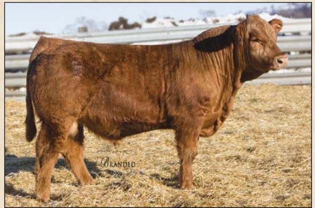
CMK D13 • Sells as Lot 10.

A son of Durango 366A we chose for our AI program. His sons have excelled in performance and eye appeal. Weaning ratio of 101. Outstanding cow family in our program that continues to produce some of our top calves every year. Dam of D13 is a full sister to the dam of lots 9 and 11.