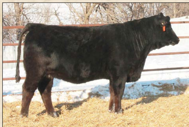
PHG Connie C20 • Sells as Lot 27.

Connie C20 is one of the very few Super Flex daughters to leave PHG. We lost Super Flex after his first breeding season, so these daughters are pretty rare! We've only sold two other daughters, and both have been sale toppers. C20 comes to us from a Payday daughter, who's dam was purchased out of this same sale. Homo black and polled tests are pending and will be available by sale day. Sells bred to our calving specialist COLB Mr Xavier X812 for a 4/10/2017 calf. Ultrasound was unable to determine the sex.