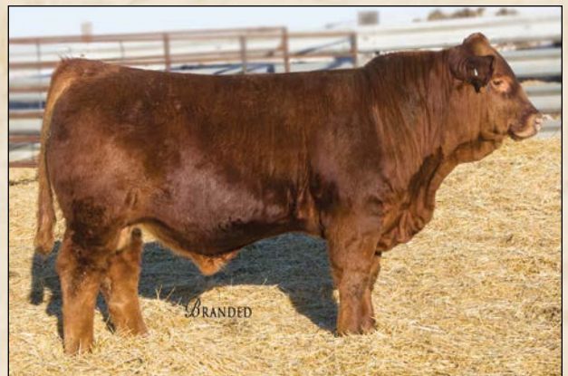
CMK D15 • Sells as Lot 11.

These 3 sons of Durango 366A are all out of full sisters making them all full brothers in blood. D15 weaned with a ratio of 109. This cow family is very strong for performance and maternal values in our program. Dam of D15 is a full sister to the dam of lots 9 and 10.