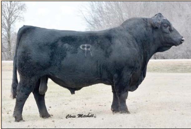
DCSF Post Rock Astronaut 157A • Sire of Lot 45.