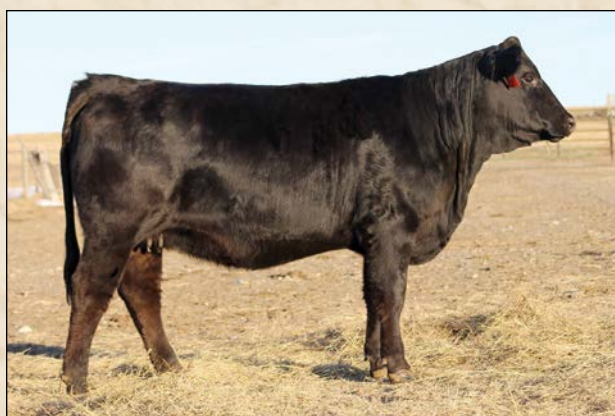
BRTV Chickadee • Sells as Lot 39.

The HXC Conquest Red Angus sire has worked great in our herd, producing moderate framed, thick made, low birthweight sons and daughters. You will have many breeding options with this heifer, as she has a very well balanced EPD profile. She is due on March 7 with a bull calf by our new red calving ease sire IVERS Jake C10 ET.