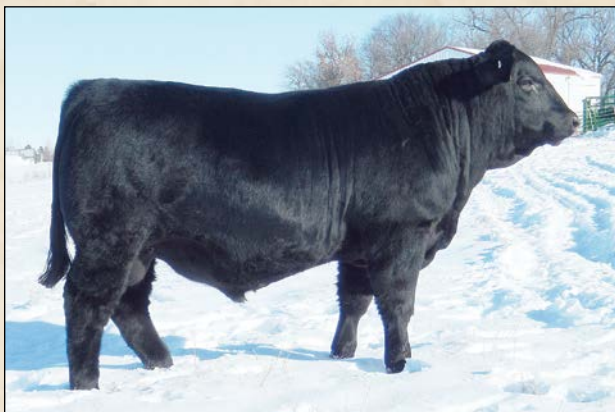
WOHL Leverage's Impact D55 • Sells as Lot 14.

WOHL FARMS, JOHN WOHL Genomic enhanced EPDs. Clean fronted, deep bodied and docile purebred. Dam is moderate framed with excellent udder and out of a solid producing cow family. He has all the components of a future herd sire. Sire verified and AI permit ready. Retaining 1/3 semen interest