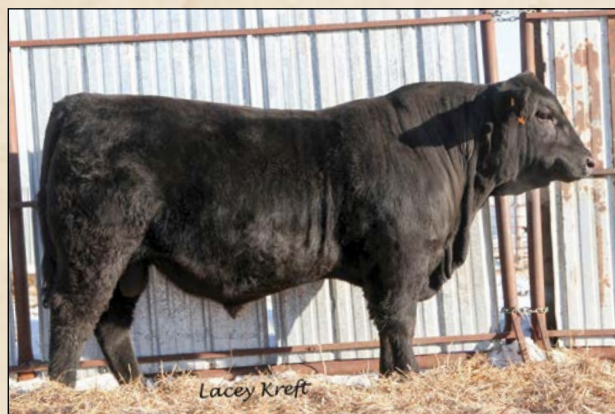
ZIMM Doc • Sells as Lot 1.

If you want to add pounds to your calves and keep replacement heifers that turn into brood cows take a look at this guy on sale day. Out of another Wohl Otto X7 Dam which proves that his daughters just flat out perform.