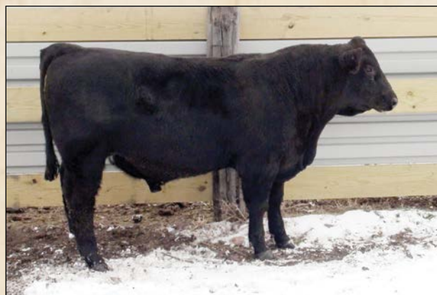
FGC D4 • Sells as Lot 20.

Black homozygous polled 50% Balancer bull packed full of performance. Weaning ratio of 104 with a weaning and yearling EPD that rank in the top 1% of the breed. His sire won the North Dakota Angus feed trial. D4 will sire calves with explosive growth and great feedlot performance.