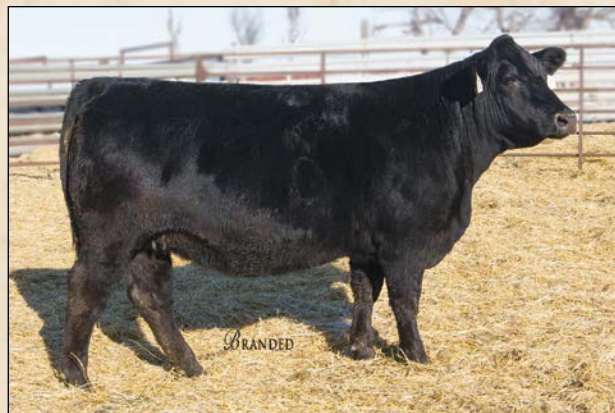
DDGR Adele 74C • Sells as Lot 36.

This heifer by the Connealy In Focus 4925 sire is a half-sister and almost a carbon copy of the Sydney 27B heifer sold in last year's sale where she was the high selling Balancer female. Adele's dam is a young cow that is doing a great job, with a nursing ratio of 105 on her first three calves. Due with a CCR0 Leverage heifer calf on March 7.