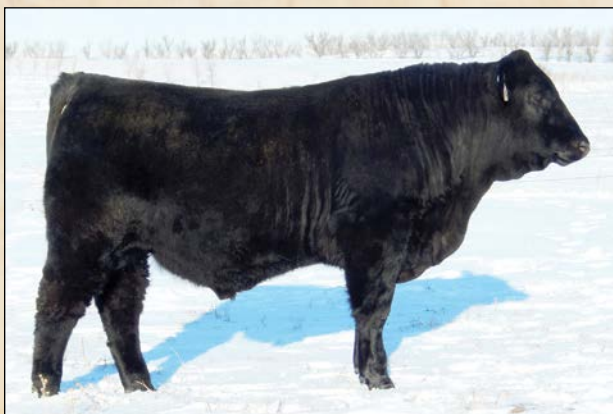
WOHL Brule's Focus D627 • Sells as Lot 25.

Dam is a Dam of Distinction that has weaned 11 calves for a weaning ratio of 104. Sired by DAHL 35A, a bull we purchased that is siring some outstanding calves. Posted a weaning ratio of 106.