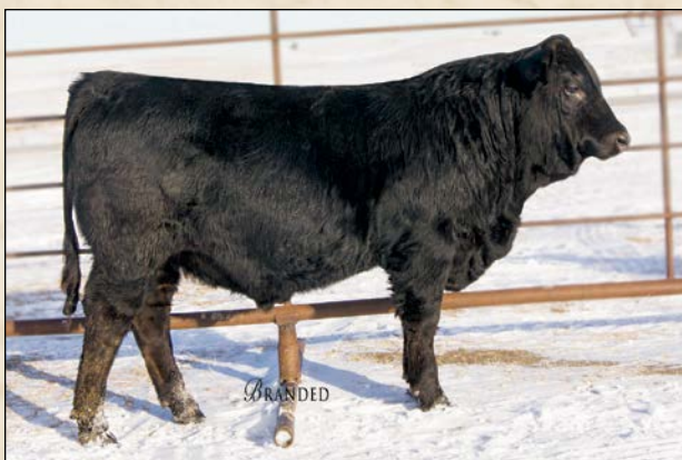
BDKR D8 • Sells as Lot 23.

Performance bull that weaned at 800 pounds with a weaning ratio of 112. Note the weaning and yearling EPDs that rank in the top 1 and 2 percent respectively.