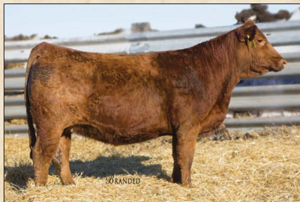
DDGR 87C • Sells as Lot 37.

An attractive purebred daughter of the DDGR All In 1A sire that was the high selling bull in our 2014 production sale. Her EPD's indicate a nice spread from birth to weaning and yearling as well as a marbling EPD in the top 15% of the breed. She is due with a purebred bull calf on March 7 by the popular AI sire BNC At Ease.