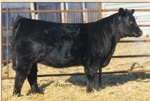
SGAR Daisy Duke 603D • Sells as Lot 53.