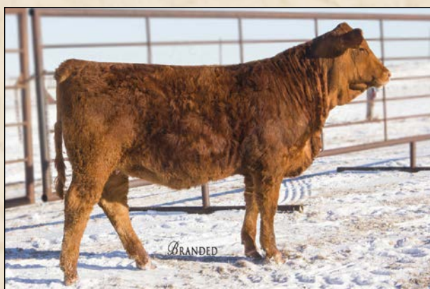
DCHD Golden Buckle Gelv 319D • Sells as Lot 51.