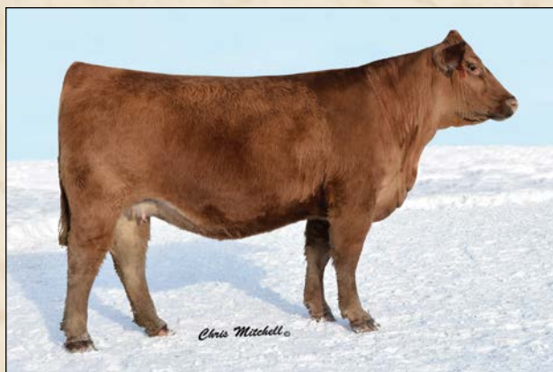
LRSF LRL Snazzy C73 • Sells as Lot 31.