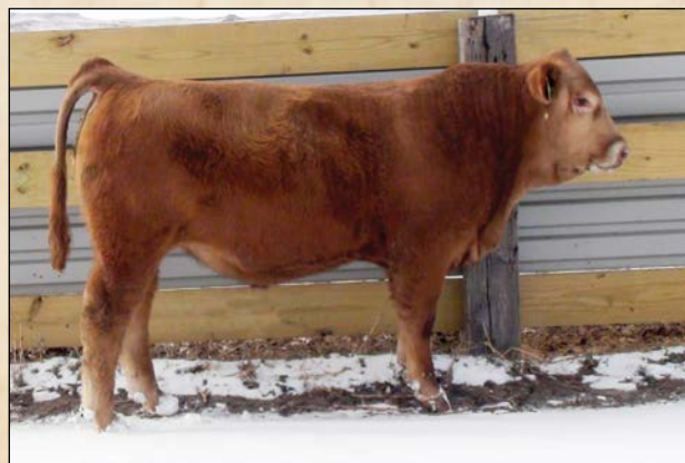
FGC D5 • Sells as Lot 21.

Sired by DAHL 35A, a bull we purchased that is siring some outstanding calves. D5 weaned over 800 pounds with a weaning ratio of 115. This red bull can give you performance and extra weaning weight in your calves. His dam is a Dam of Distinction.