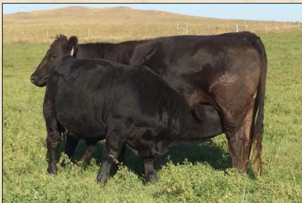
WOHL Brule's Impact D37 • Sells as Lot 16.