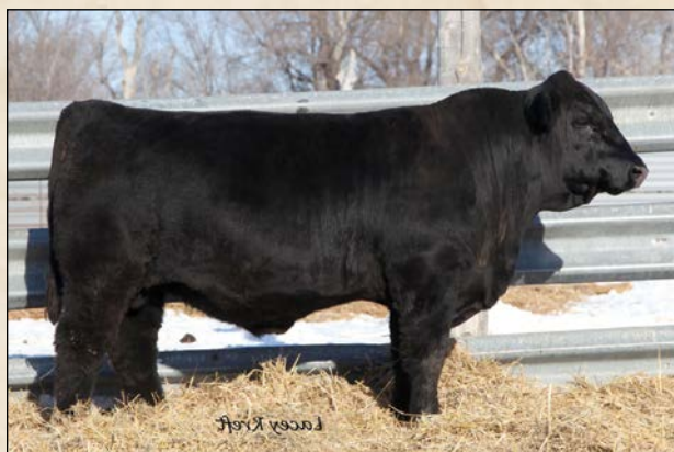
ZIMM Dawson • Sells as Lot 6.