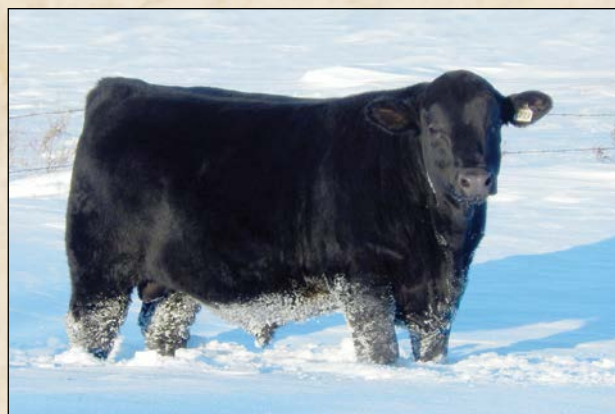
WOHL Brule's Gent D13 • Sells as Lot 19.

Heifer bull and sire verified. He is smooth shouldered, consistent calving ease on sire and dam sides. Low birth weight with quick growth. Same cow family as 2016 high selling bull. Retaining 1/3 semen interest.