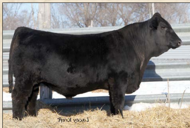
ZIMM Dakota • Sells as Lot 2.

A 75% that is as clean and smooth as you will find. Keep all of his daughters as he is out of a great cow family. Homo Black and Homo Polled