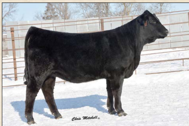
LRSF LRL Nellie D40 • Sells as Lot 50.

Daisy Duke is a stylish female. She is put together with plenty of length and thickness without giving up her feminine qualities. Her mother is a high producing, excellent milking female wrapped in a moderate frame. When you combine all of these traits it makes her a valuable addition to any herd and a top show prospect. Sells open.