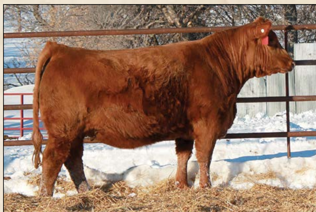
PHG Miss Paparazzi C45 • Sells as Lot 30.