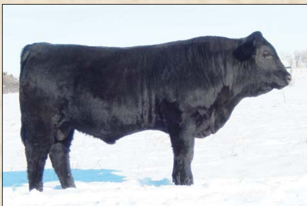
WOHL Ludlow Pepper D203 • Sells as Lot 15.

WOHL FARMS, JONATHAN WOHL Genomic enhanced EPDs. Length, thickness and sire verified. The N22 matriarch has a number of daughters producing bulls and replacement females. His sire reduced birthweight, kept thickness and length. Use him on cows for added weaning weight.