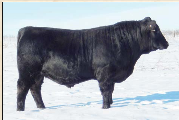
WOHL Impact Firewall D21 • Sells as Lot 18.

Heifer bull and sire verified. Another Y353 bull calf with consistent low birth weight and calving ease. Very moderate frame with muscle packed on. Cow family has placed high sellers in previous NDGA sales.