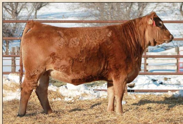
PHG Cowgirl C32 • Sells as Lot 29.

Cowgirl C32 is the first bred daughter of Jackson to sell at auction, and wow is she cool! This is a pedigree that will work in any herd, loaded with some major Canadian power houses on both the top and bottom sides. Deep ribbed and soft made, she's going to make an awesome mama cow. She sells bred to RWG Yikes, who's making quite the mark on our herd. We've used Yikes successfully on heifers the last two years and have been very impressed with the results. Homo polled results are pending and will be available by sale day. Sells bred to RWG Yikes 1512 for a 3/15/2017 purebred heifer calf.