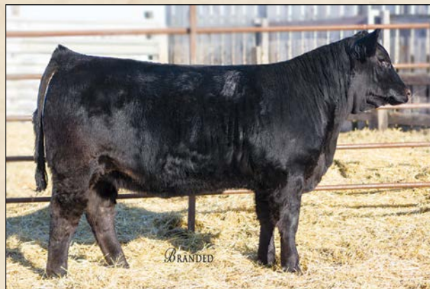
SGAR Dandy Gal 610 D • Sells as Lot 54.

Dandy's Gal is a thick well-proportioned heifer that is going to produce consistently in any replacement female program. This heifer is the maternal sister to our high selling heifer sold here at the Golden Rule last year. She displays as much or more potential than her half-sister. She will be the one to take a close look at. Sells open.